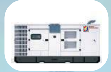
SOUND ATTENUATED CANOPY GENERATORS