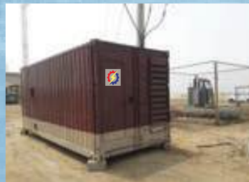
1 X 800KVA GENERATOR AT NAQUA