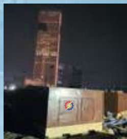
FORMULA-1 EVENT IN JEDDAH