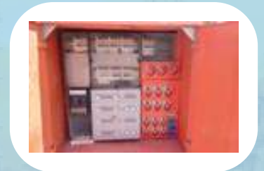
DISTRIBUTION SOCKET PANEL