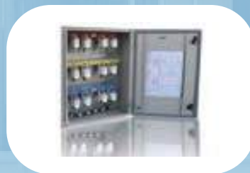
DISTRIBUTION SOCKET PANEL