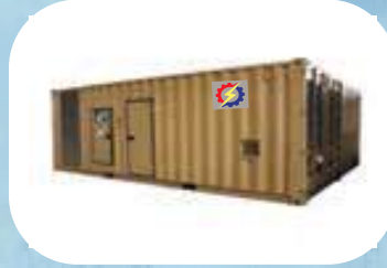
SOUND ATTENUATED CONTAINERIZED GENERATORS