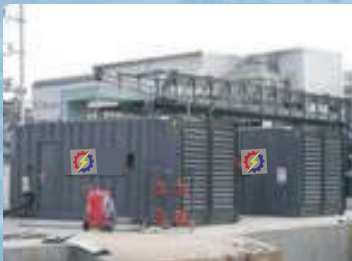
2 X 1250KVA GENERATORS SYNCH AT NESMA RECYCLING PLANT IN INDUSTRIAL CITY