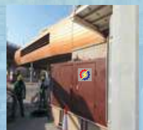
1 X 125KVA GENERATOR AT KAIA