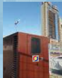
1 X 200KVA GENERATOR AT JEDDAH FESTIVAL