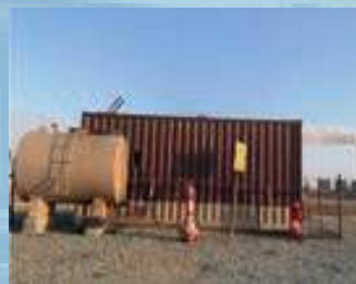
2 X 500KVA GENERATORS IN RAWAFID IN SHOAIBA