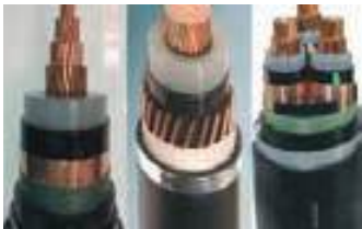
LV / HV CABLES