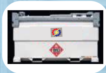
DOUBLE BUNDED FUEL TANK